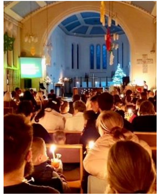
Christingle service on Christmas Eve