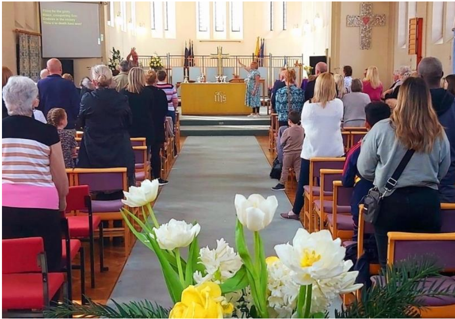
Sunday morning worship